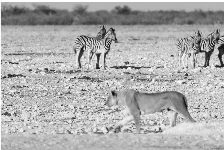
Figure 3 Food-chain relationships in mammals

Mammals occupy different positions in the food chain. Some mammals are herbivorous, such as cows, deer, and elephants, which maintain life by feeding on plants and become a source of food for carnivores. Other mammals, such as lions, tigers, and jackals, are carnivorous and obtain food by preying on other animals. The interaction of these food chains maintains ecological balance in the ecosystem. For example, on the African savannah, herbivorous animals such as zebras and wildebeests are the main prey of lions and leopards, maintaining the balance of the grassland ecosystem (Figure 3).