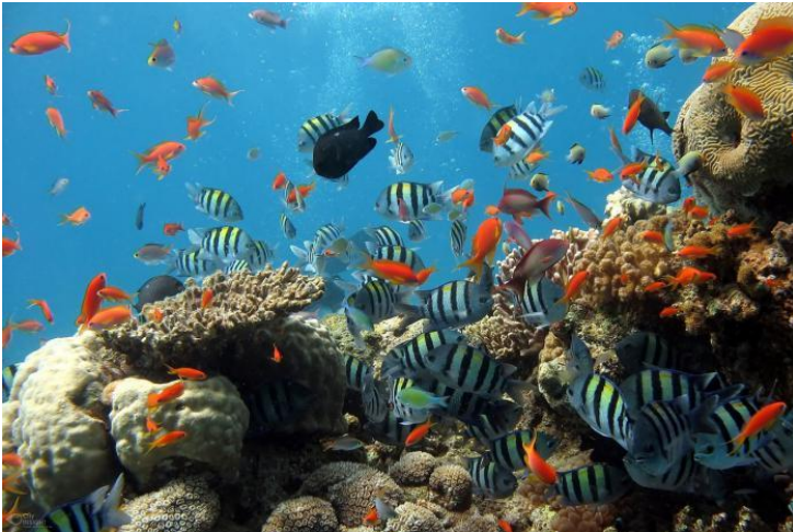
Figure 2 A coral reef ecosystem

The aquatic ecosystem also provides important resources, such as fisheries and freshwater supply. These resources are crucial for global food security and water resource management. At the same time, aquatic ecosystems also play an important role in the carbon cycle, absorbing a large amount of carbon dioxide and helping to mitigate climate change. For example, the freshwater lake system in the Great Lakes region of the United States is one of the largest freshwater lake clusters in the world, supporting a large number of fishing and water supply needs. These lakes are not only important resources for local communities, but also play a crucial role in global ecological balance.