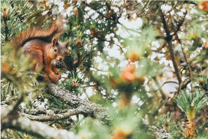
Figure 4 Squirrels store pine cones to produce seed dispersal

Some mammals, such as rodents and civets, play the role of seed spreaders in ecosystems. They take the fruits or seeds of plants to different places by consuming them, which helps to disperse and spread the plants. This seed dispersal is crucial for maintaining plant diversity and ecosystem stability. For example, squirrels often store pine nuts, but sometimes forget their storage location, which helps with the growth of new trees (Figure 4).