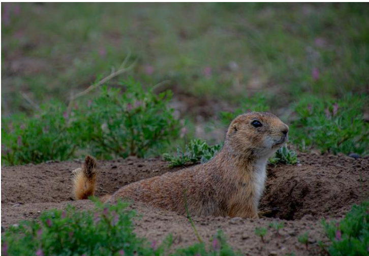
Figure 5 Soil tillers - groundmice

Some mammals, such as hamsters and wild boars, search for food by digging and flipping the soil, while also altering the soil structure. The activities of these animals contribute to soil ventilation and nutrient cycling, which are crucial for maintaining soil health and vegetation growth. For example, the groundhog in North America helps to ventilate the soil and promote the growth of grasslands during the excavation process (Figure 5).